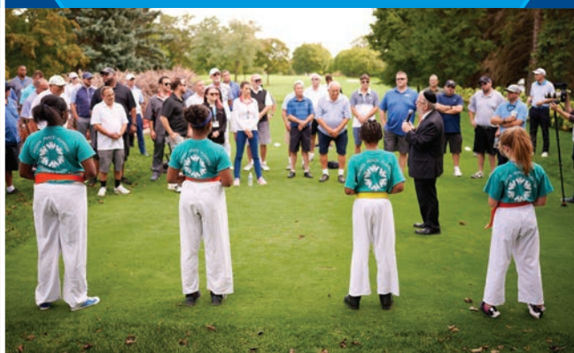
Heroes Circle program participants demonstrating at our previous Golf Outing

Thanks to your generous support, martial arts classes, uniforms and transportation to and from classes are provided to families at no cost.