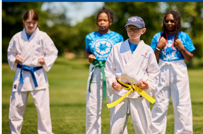
Heroes Circle program participants demonstrating at last year's Golf Outing

Thanks to your generous support, martial arts classes, uniforms and transportation to and from classes are provided to families at no cost.